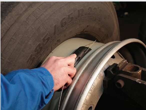
Left: retrofitting a tyre pressure monitoring system Right: all you need for the Conti PressureCheck fitment